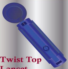
Twist Top Lancet