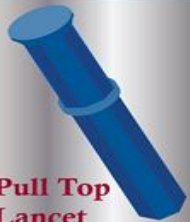
Pull Top Lancet